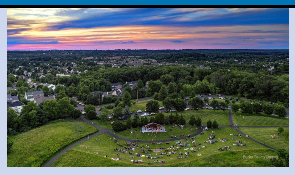
Hansell Park, Buckingham Township, Bucks County, PA.