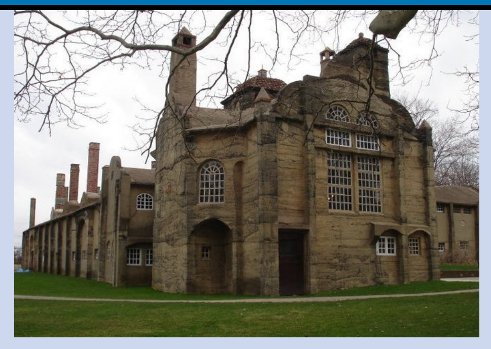
The Tile Works of Bucks County, Doylestown Township